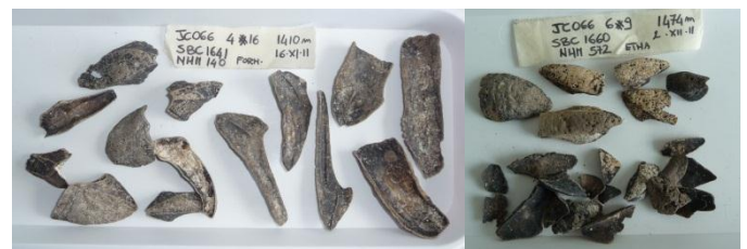
Figure 2 A selection of plates from Coral seamount (left) and Middle of What (Right). Label tape is 25 mm wide